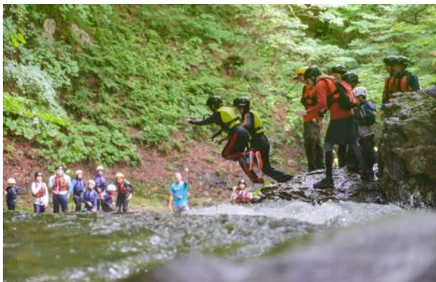
STREAM HIKE: Campers take the skills they have learned and try to conquer their fears hiking to a waterfall.