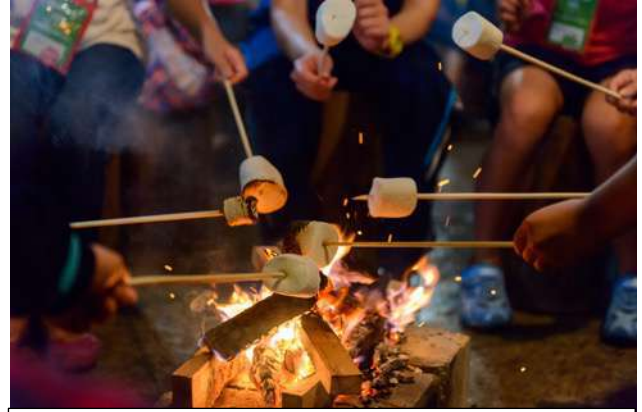
TEAM FIRE: Teams roast marshmallows and sing songs to build team spirit.