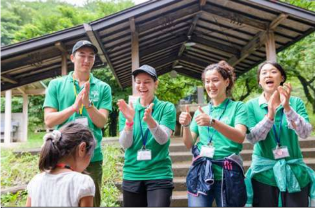
ORIENTATION: Campers meet their team leaders for the first time.