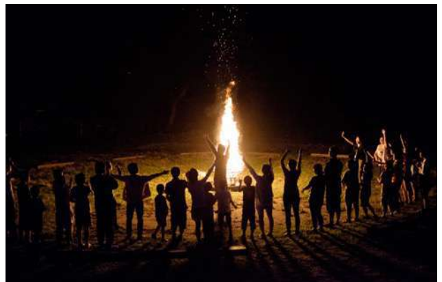
CAMP FIRE: Everyone shares one final evening together, singing songs and sharing memories from camp.

Everyone at Mirai no Mori is really looking forward to creating another MAGICAL camp experience with you all!