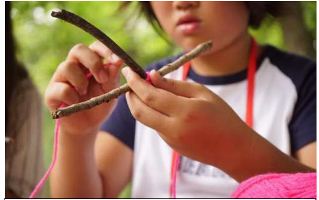
CRAFT: Campers get creative while learning to craft with nature.