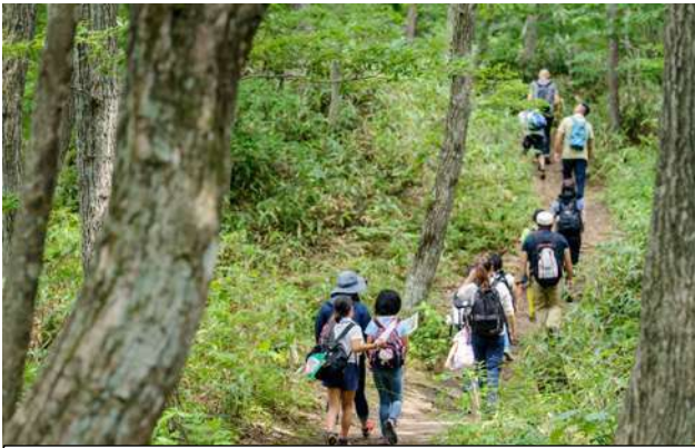
HIKING: Campers embark on their first adventure into the woods.