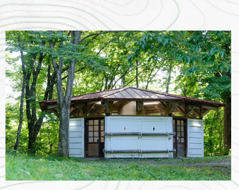
The bathroom is open-aired with few Japanese-style toilets and one western style toilet per side.