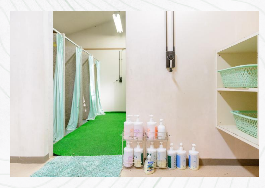
Showers are available on-site. Staff is welcome to use them 24/7, while it is off-limits to campers except during their designated shower time. Shampoo and body soap provided by the campsite are also free to use.