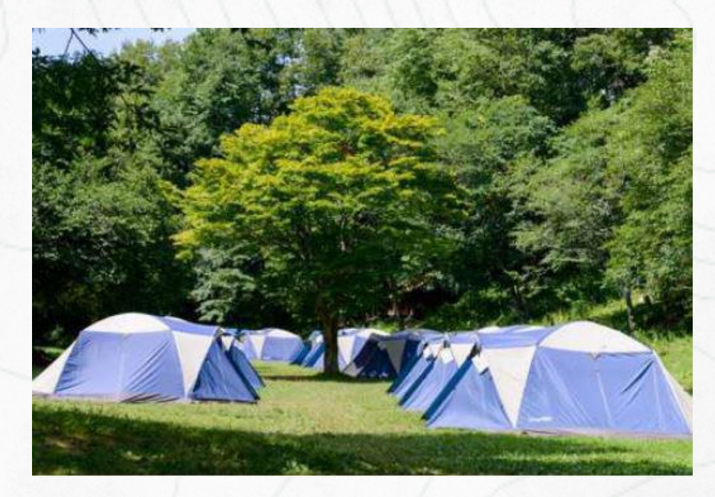
We will have a campsite to ourselves, where we do most of the activities, such as cooking, crafts, marshmallow roasting, team building activities, etc.