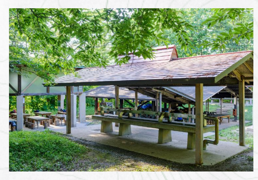
The kitchen is outdoors. All the staff and campers help out to prepare and clean up after each meal.