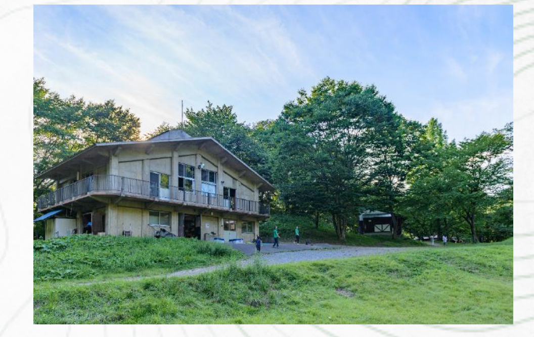
This building is where our office, indoor play area, and camp supplies are held. You can come here to rest during your time off, charge any electronics, and do your laundry.