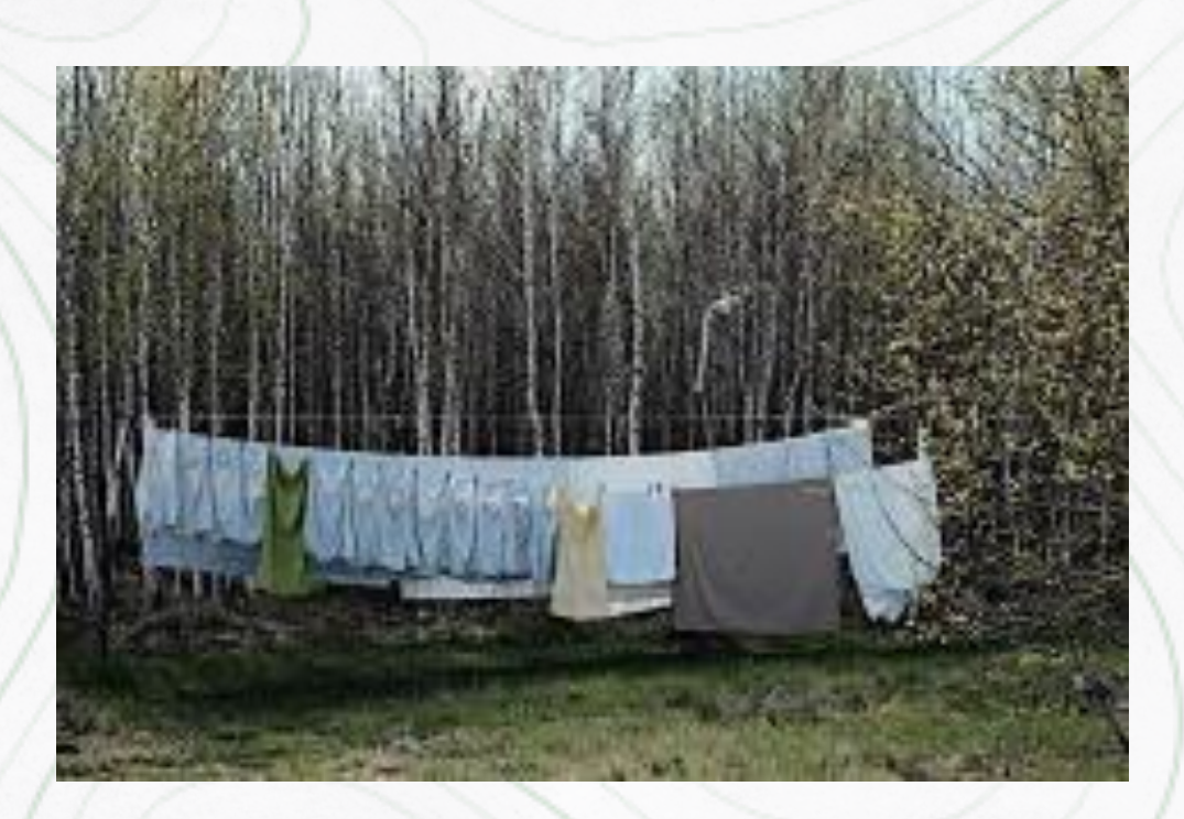
Laundry: The washing machine is available anytime supplied with laundry detergent for staff.

Phones do NOT have a stable reception. Wi-Fi will be available in the office, even though it's not stable enough to serve multiple devices. Free Wi-Fi is available in the main campground building, away from the campsite, but you will only be able to use it during your time off.