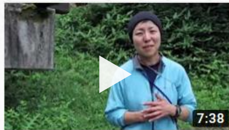
Mirai no Mori Staff Voice

Watch these videos for a better idea on what the camp is like: