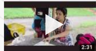
Mirai no Mori Camp Tour 2:31