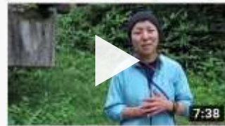
Mirai no Mori Staff Voice 7:38

Watch these videos for a better idea on what the camp is like: